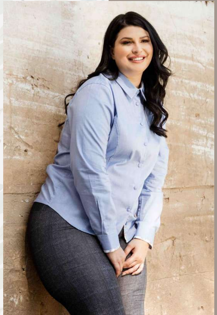
ZOE ROYAL BLUE