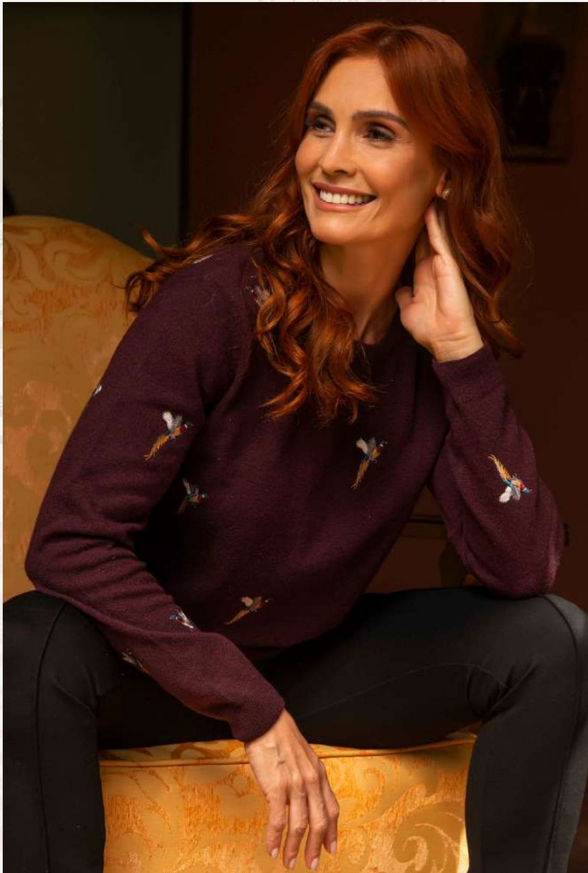
AMANDA BURGUNDY PHEASANTS