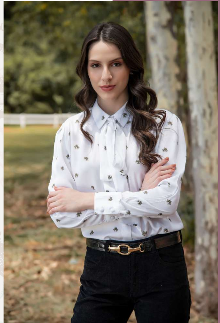
LISA JEWELLERY BEES