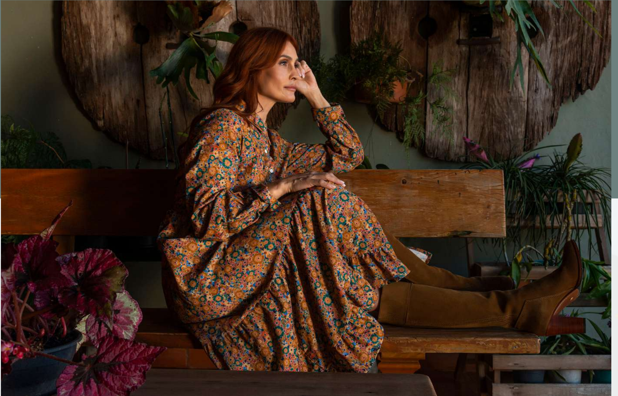
SIENNA RUST FLOWERS