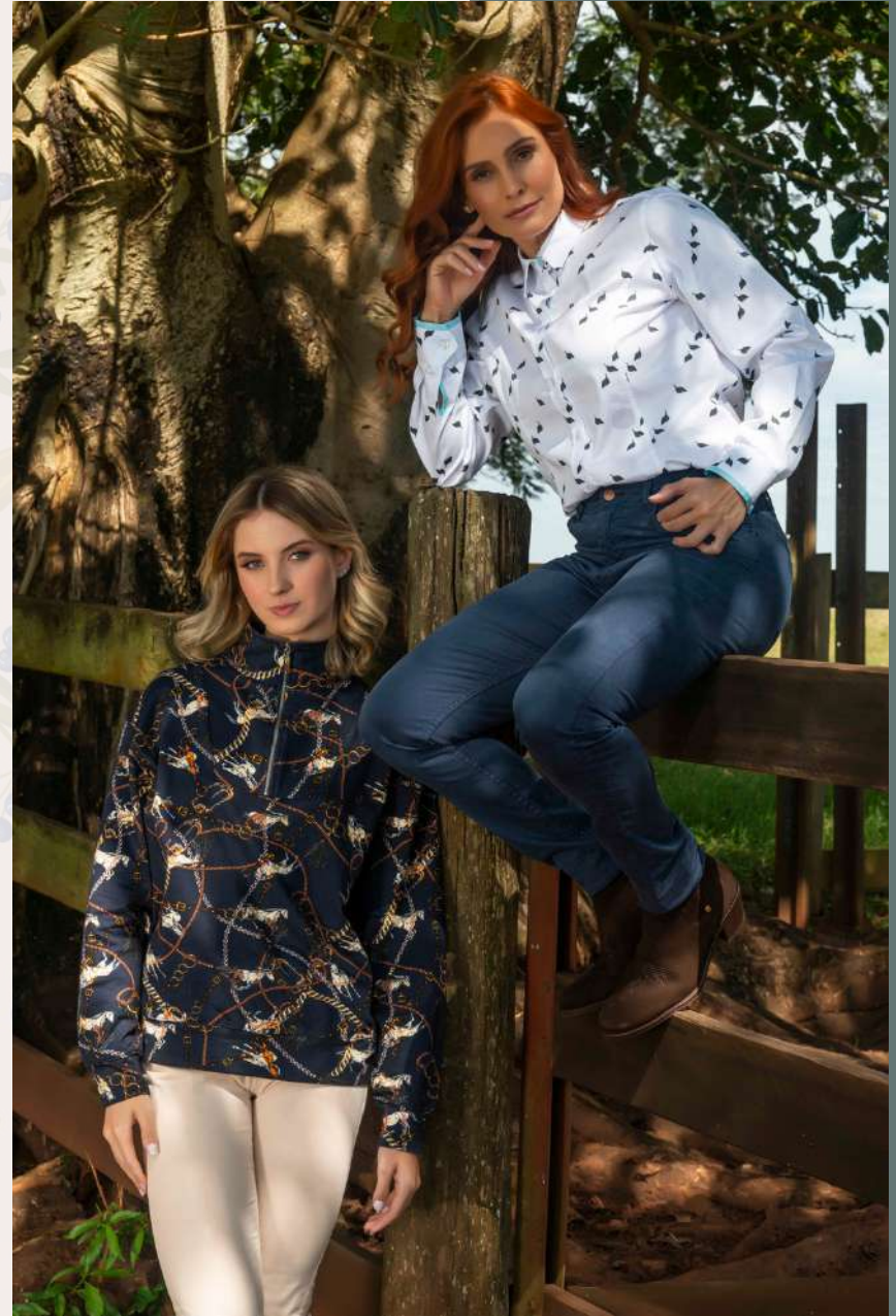
SUZY NAVY HORSE CHAINS & LAYLA GUINEA FOWL