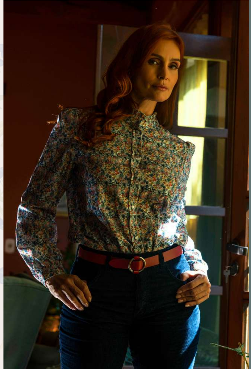
MALU SMALL FLOWERS