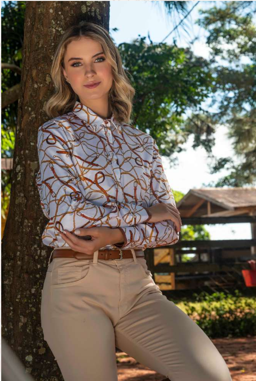
LAYLA NEW CHAINS