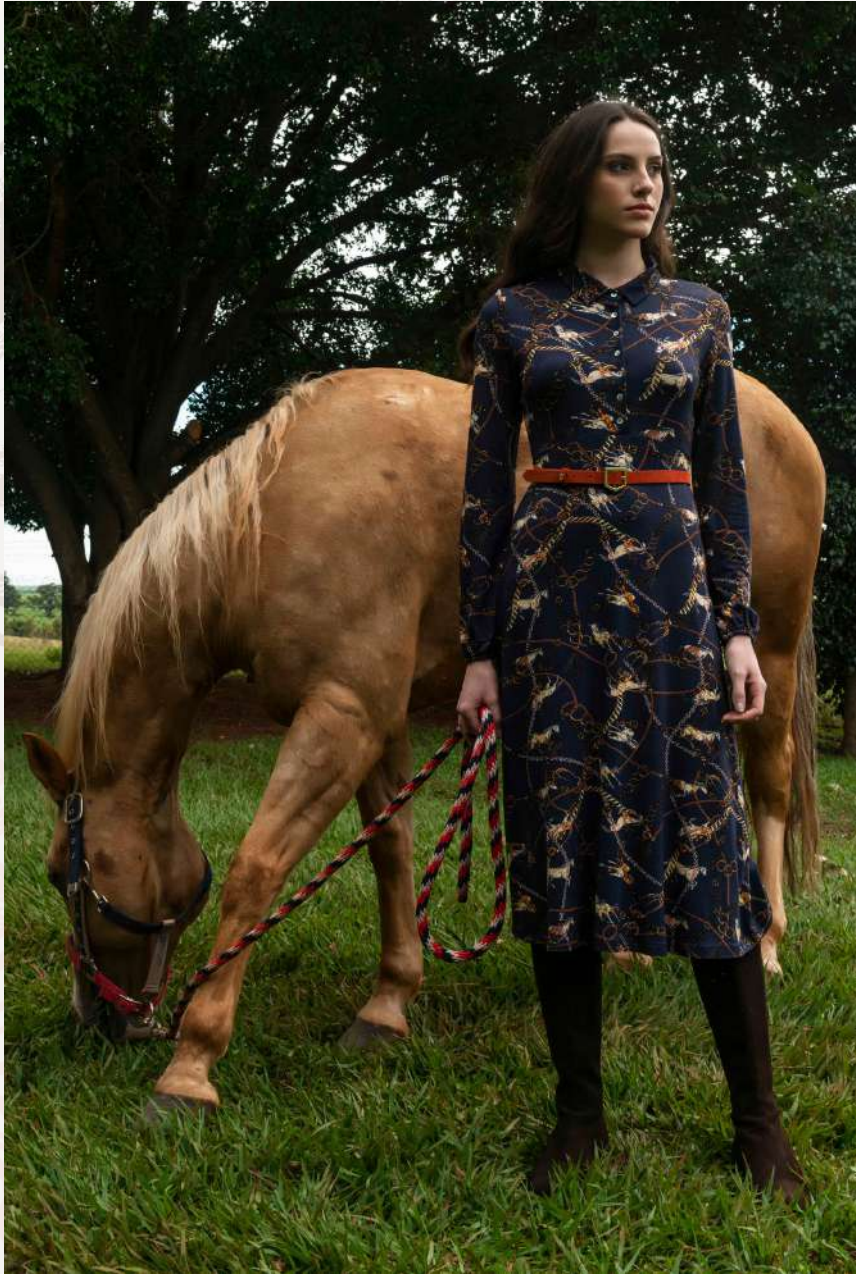
SOPHIE NAVY HORSE CHAINS