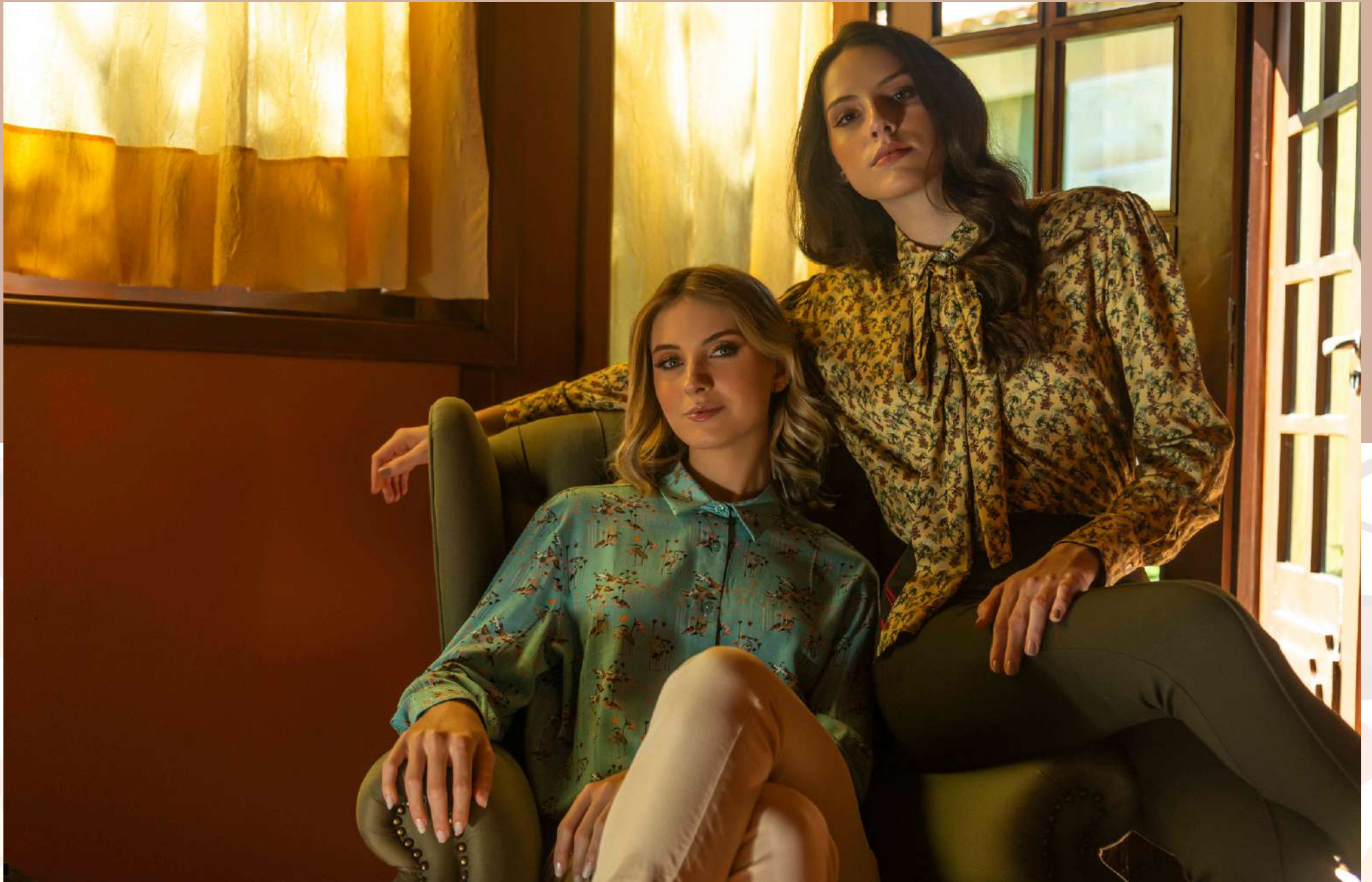
LISA GOLD FLOWERS & LYDIA TURQUOISE FLYING BIRDS