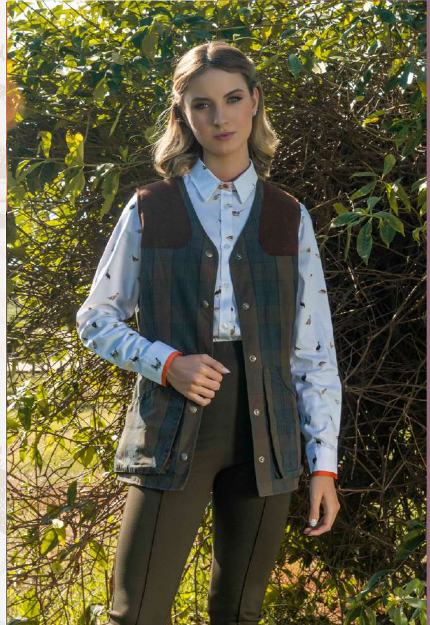
KATRINA TARTAN GILET & MILA THICK LEGGINGS