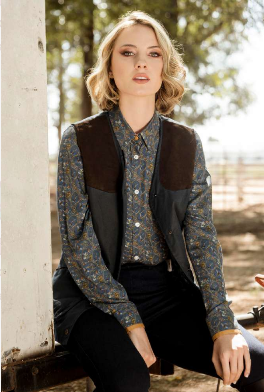
KATRINA NAVY WAX GILET