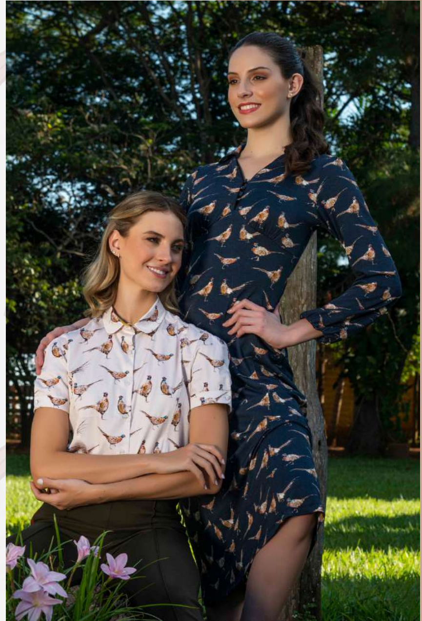
LUNA BEIGE PHEASANTS & SALLY NAVY PHEASANTS