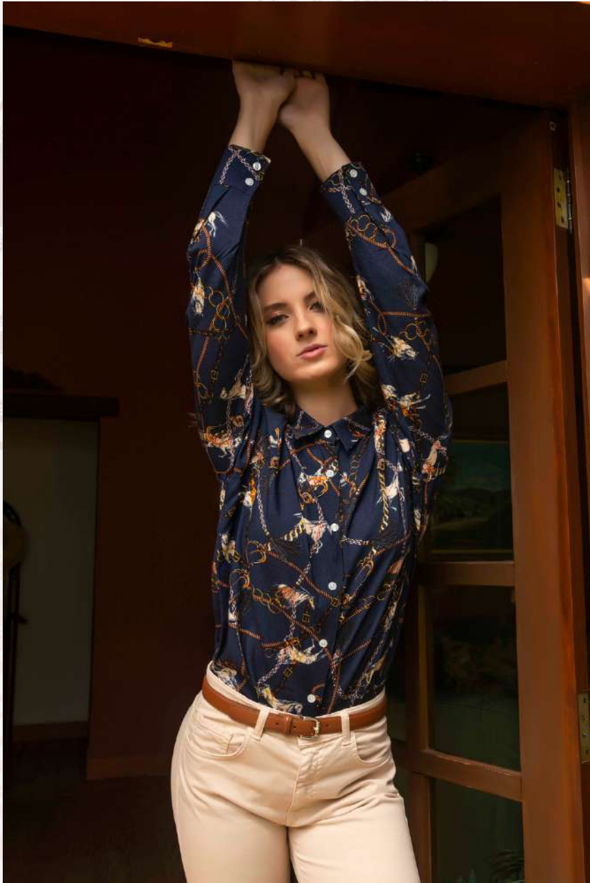
LYDIA NAVY HORSE CHAINS