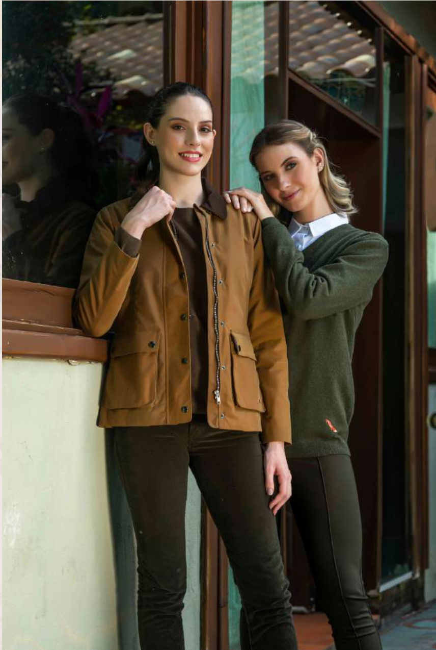
JUNE STONE WAX JACKET & AMANDA V NECK OLIVE FOXES