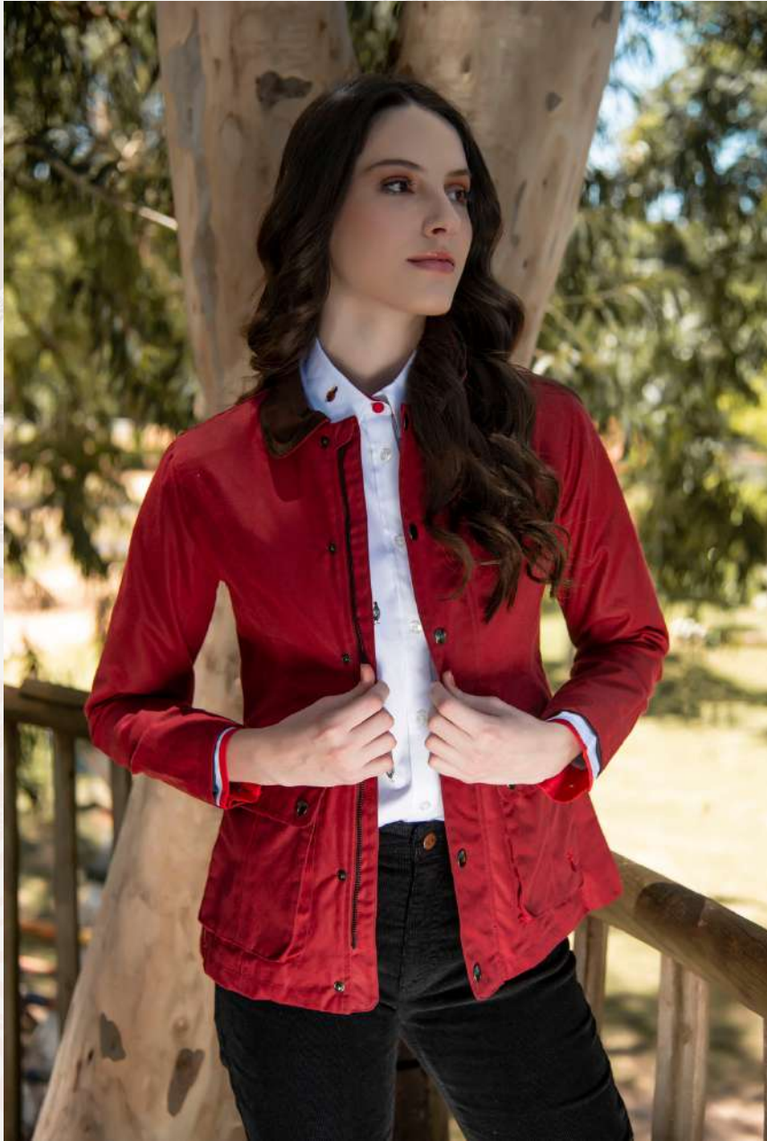
JUNE CHERRY WAX JACKET