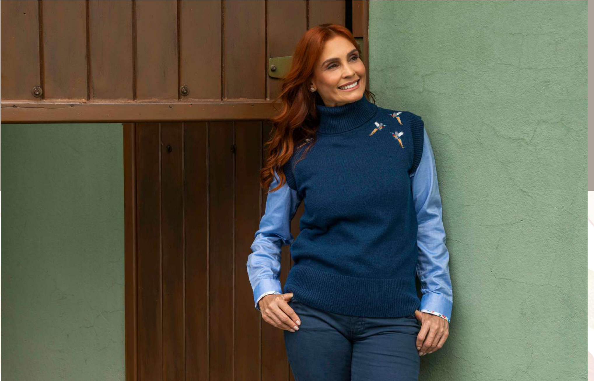
AMARA NAVY PHEASANTS