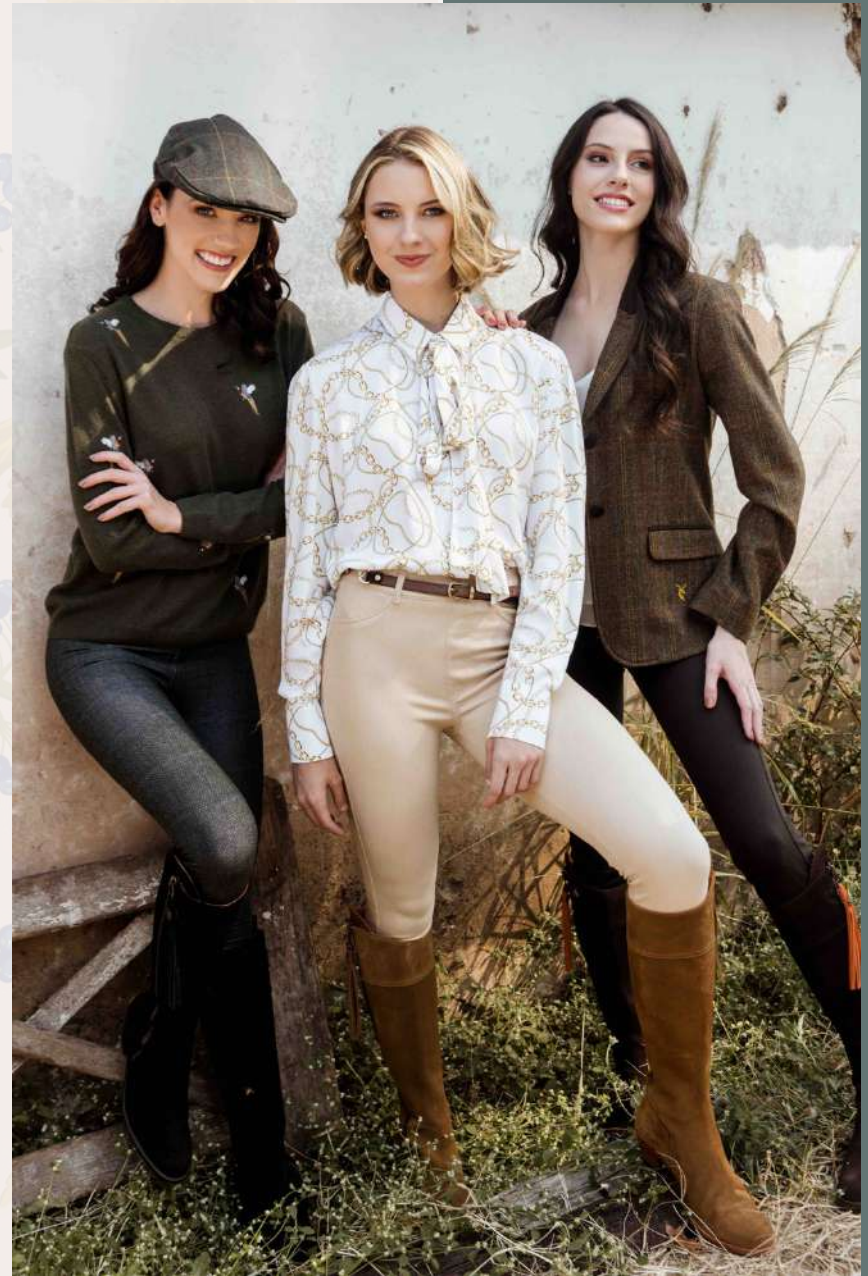
LISA NEW WHITE CHAINS