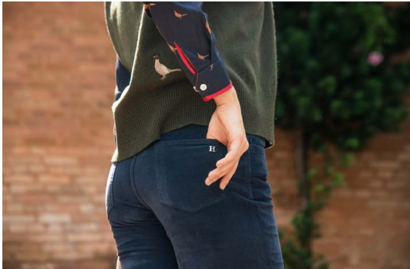
LAYLA Navy New Pheasants ROSIE Navy Super Skinny Moleskin AMELIA Olive