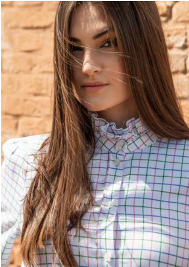
HAZEL Pink Check ROSIE Olive Super Skinny Moleskin