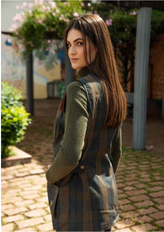
CHELSEA Flying Ducks KATRINA Tartan Wax Cotton ROSIE Olive Super Skinny Moleskin