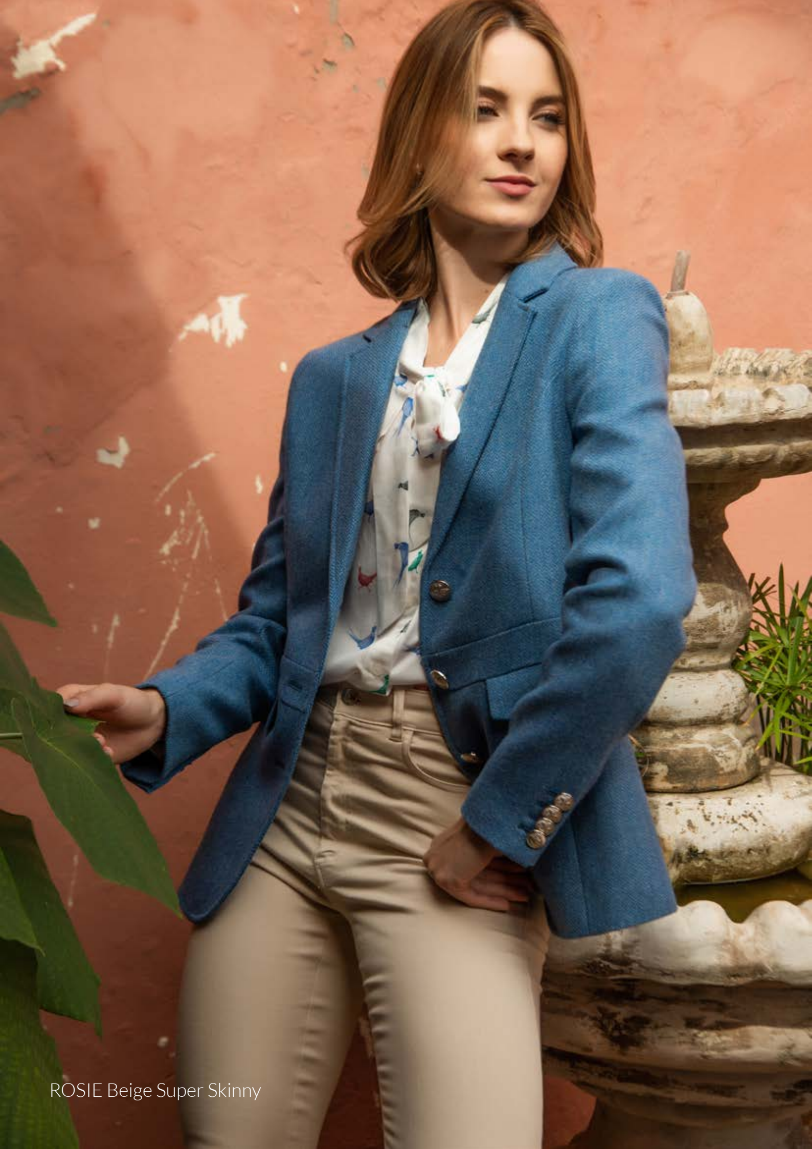
ROSIE Beige Super Skinny