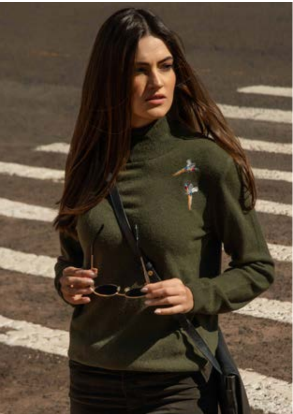
ADELE Olive Pheasants ROSIE Olive Super Skinny Moleskin