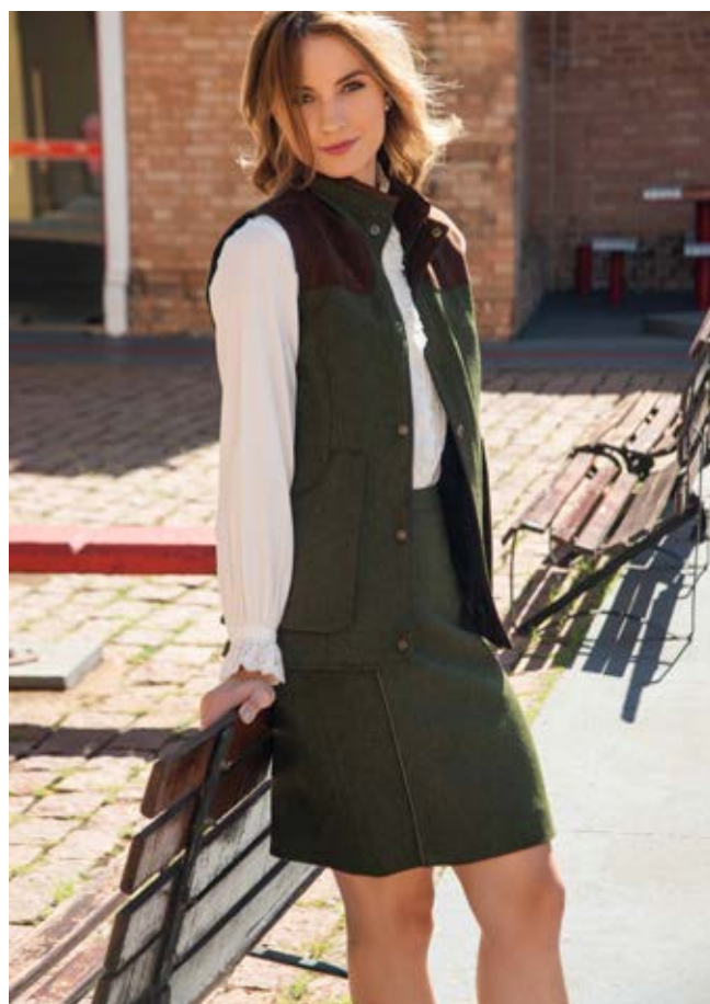
AVA Olive Wool Gilet MARINA Olive Skirt