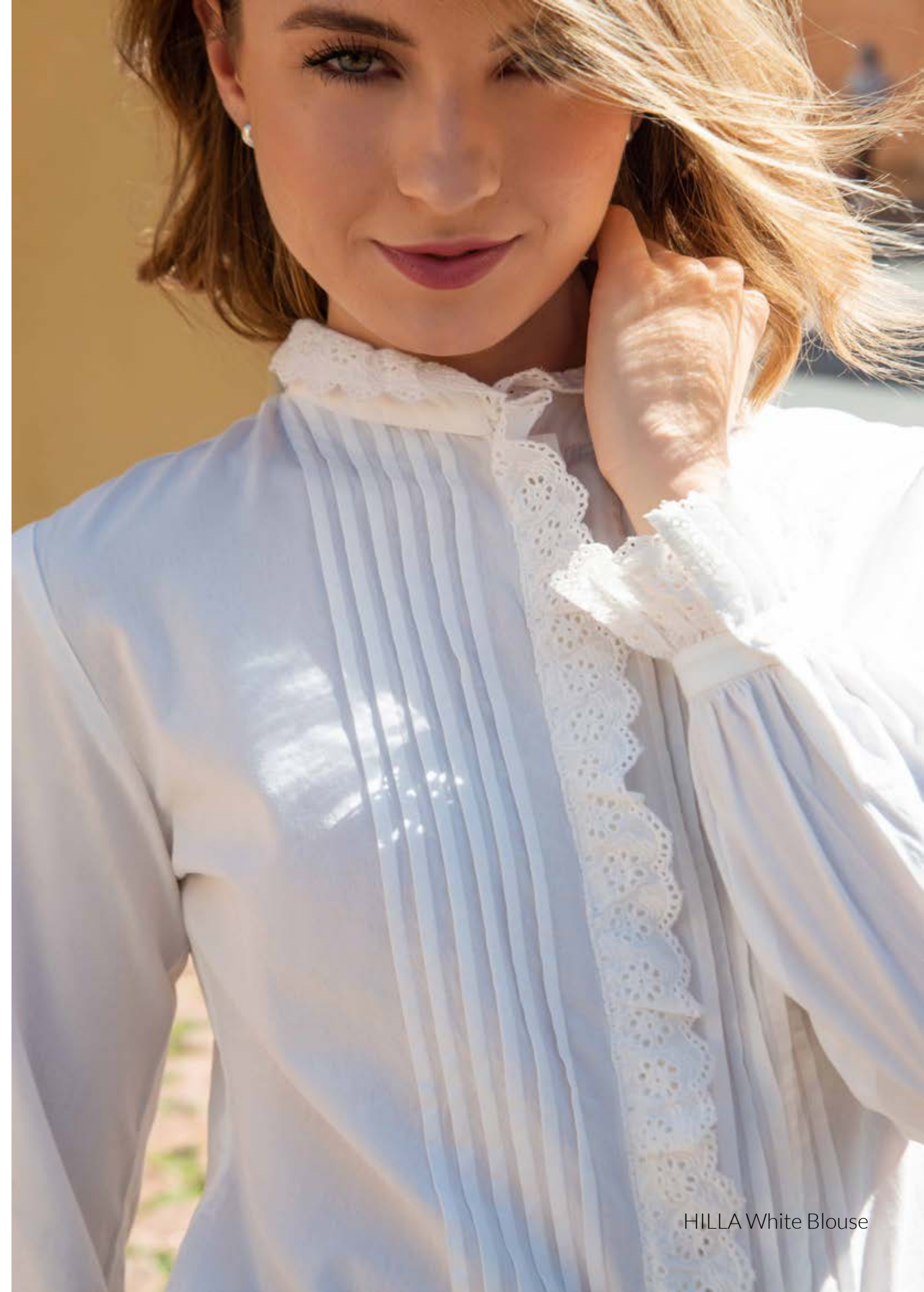
HILLA White Blouse