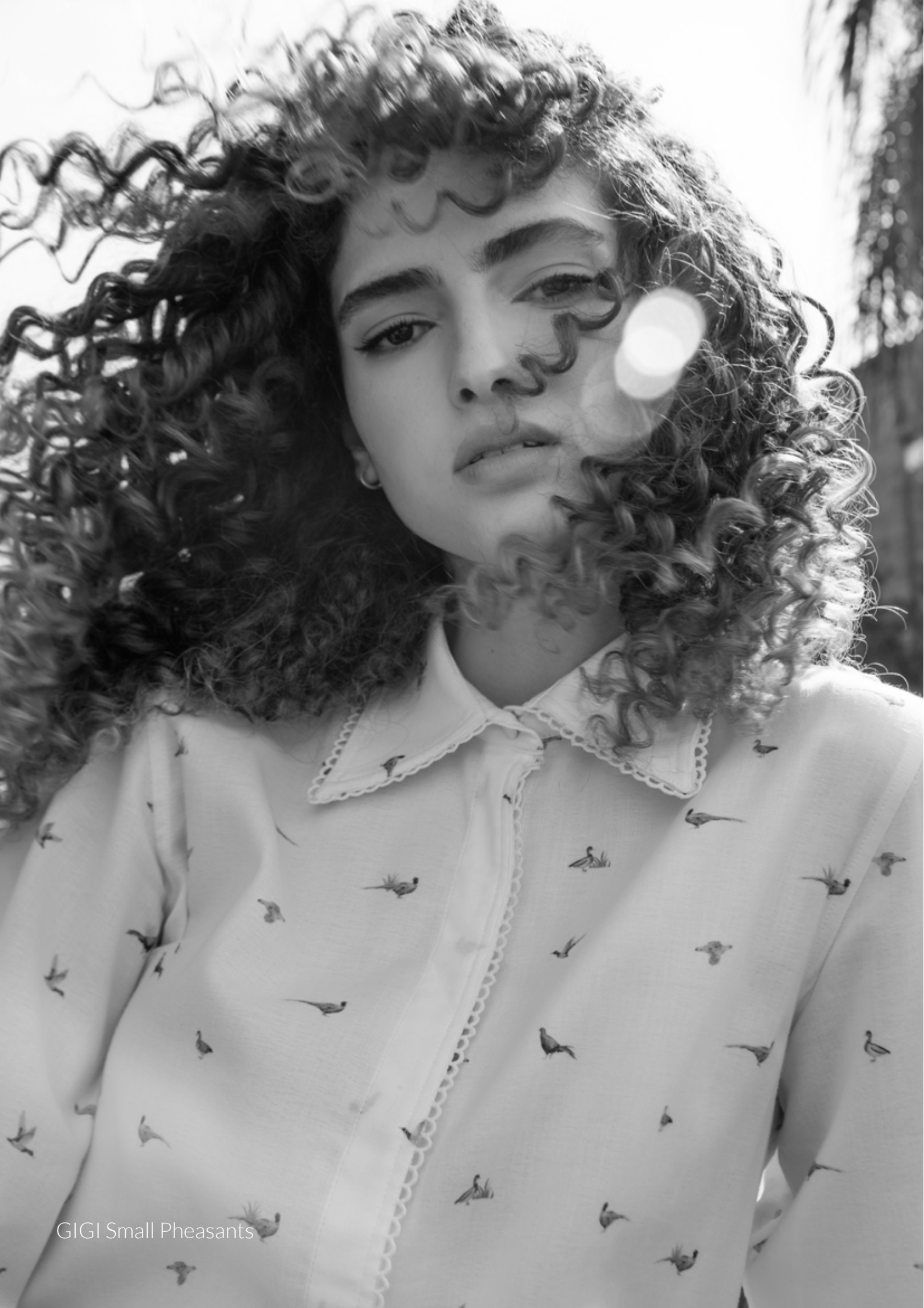
GIGI Small Pheasants