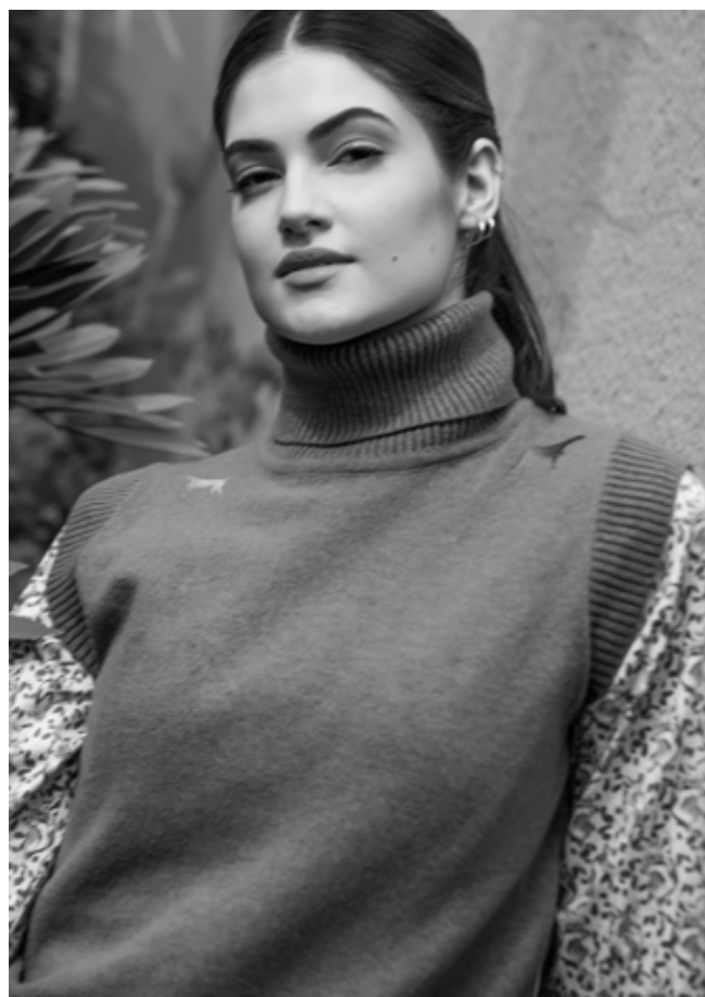
LAYLA Small Foxes AMARA Rust Pointer