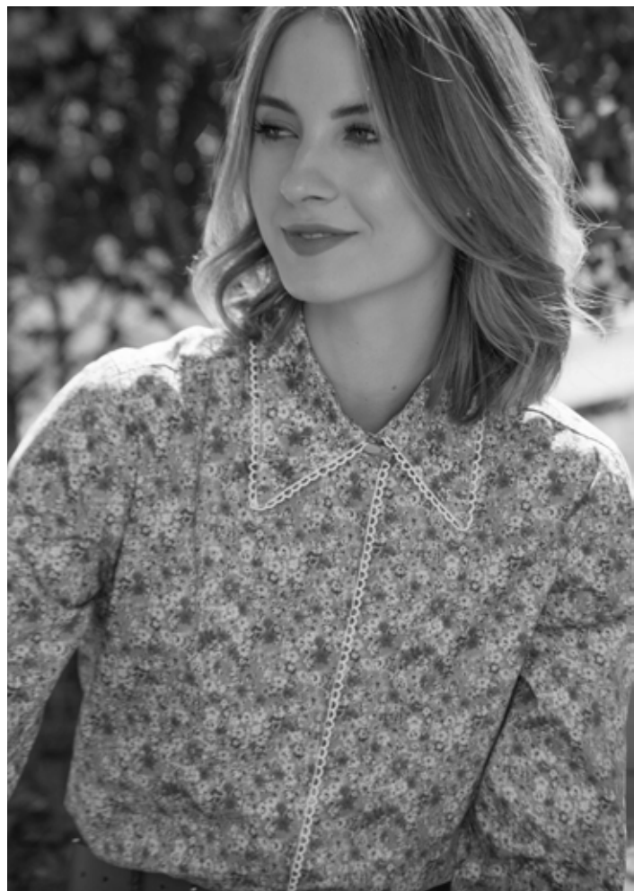
GIGI Ditsy Pink Flowers ROSIE Chestnut Super Skinny Moleskin