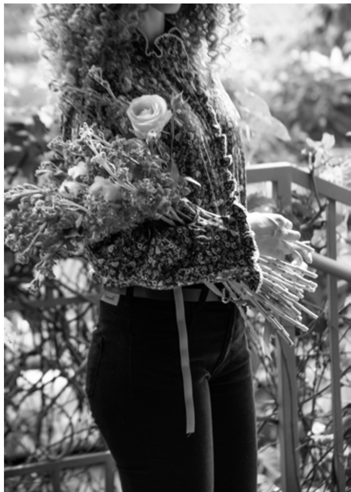
TALIA Black Ditsy Flowers ARINA Purple Velvet