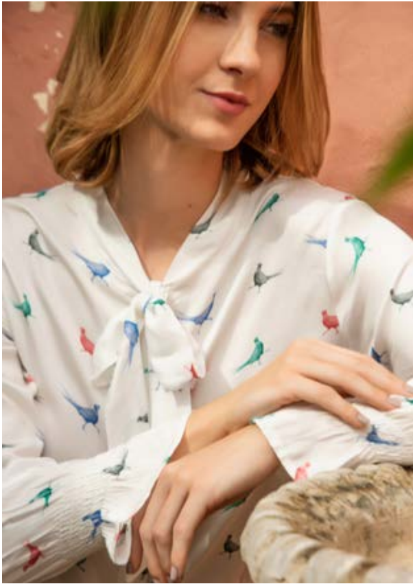
EVIE Colourful Pheasants ZIA Herringbone