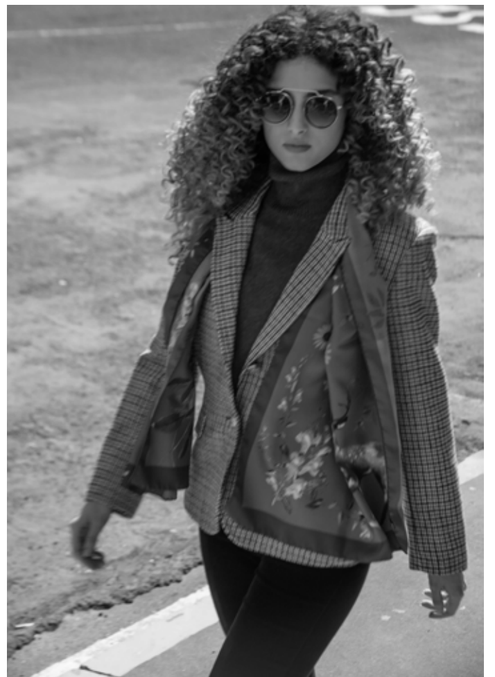
AMARA Taupe Pheasants LILIAN Prince Of Wales SABRINA Taupe Scarf